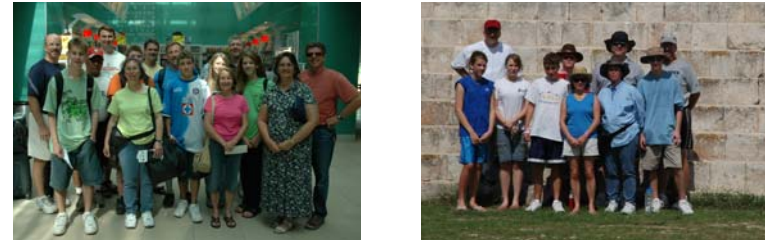
Merida, Mexico 2006