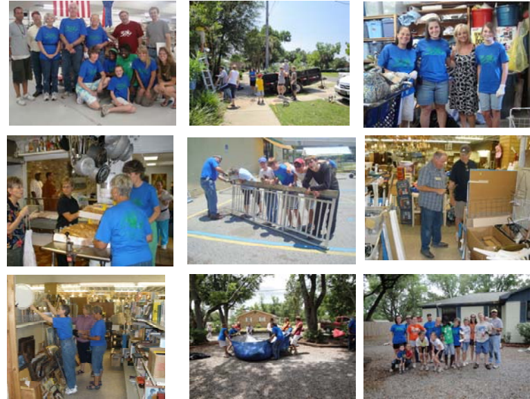
Cantonment/Pensacola 2009 Pinewoods 360°

Periodically, we take a group on a short-term missions trip. Our main focus over the years has been Merida, Mexico and Mandeville, Jamaica. But, we have also served locally and in wilderness area like Moose Jaw, Canada. Our efforts have been to minister in "Jerusalem, Judea, Samaria, and to the remotest parts of the earth."