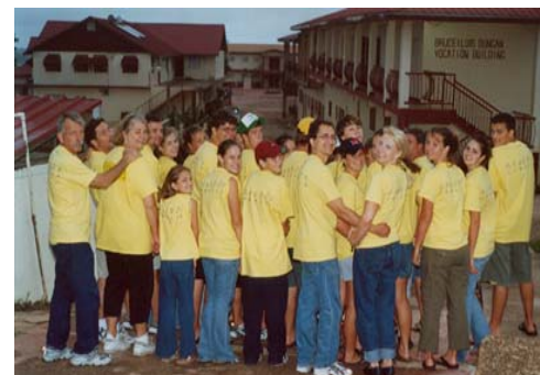
Caribbean Christian Centre for the Deaf in Jamaica.